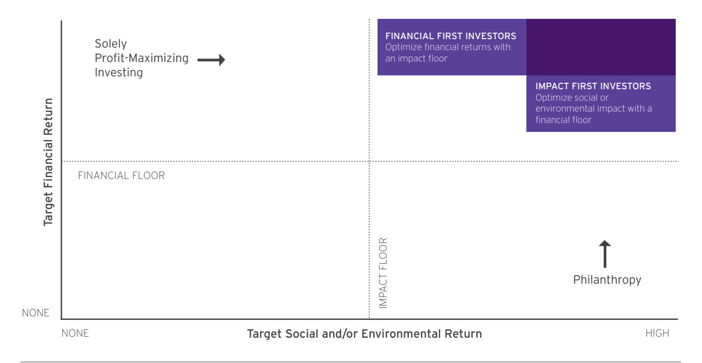
Figure 4 Target Returns for Social Venture Funds<sup>3</sup>

For example, a fund manager raising capital from traditional institutional investors in private equity, such as pension funds and strategic investors, would likely target in their fund mandate a higher financial return with a somewhat lower social return. A fund manager targeting higher social returns would likely seek out foundations, high net worth individuals, family offices and Corporate Social Responsibility ("CSR") allocations within larger corporate organizations as part of the fundraising strategy.